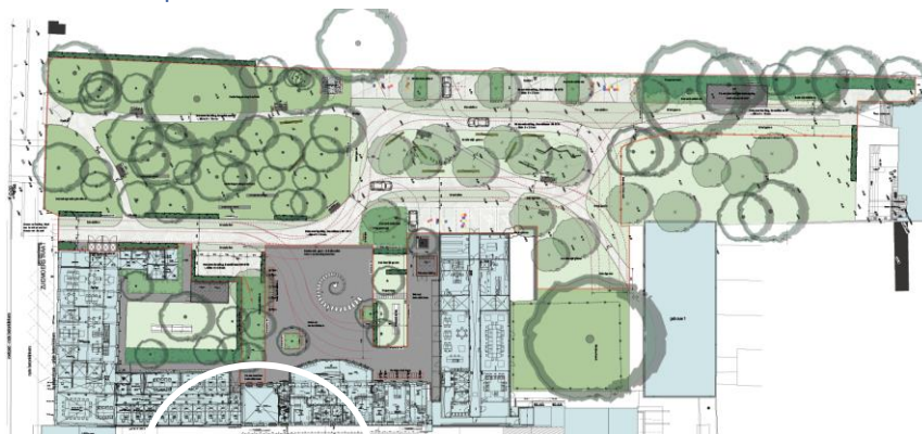
Figure 1: the ground plan of the site ‘De Zuidkaaï’ (this plan is not finalised).