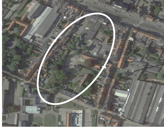
Figure 3: Site 'De Zuidkaai' on Google Maps.

The site being refurbished is a partly enclosed public space between buildings owned by the Public Welfare Center and occupied by various not for profit social organisations (figure 3) near the city center. A large part of the site was covered with hard surfaces resulting in heat stress during summers affecting the health and overall wellbeing of workers and other user of the lunch area on this site.